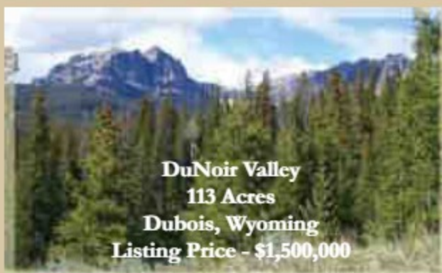
DuNoir Valley 113 Acres Dubois, Wyoming Listing Price - $1,500,000