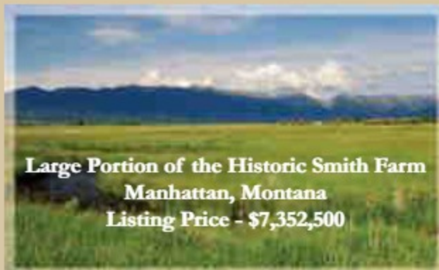
Large Portion of the Historic Smith Farm Manhattan, Montana Listing Price - $7,352,500