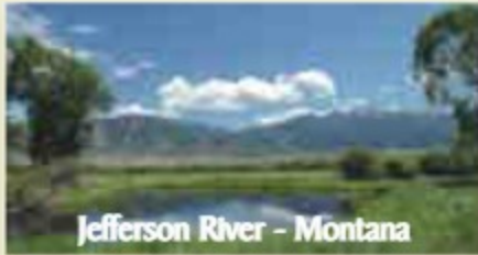
Jefferson River - Montana