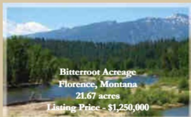
Bitterroot Acreage Florence, Montana 21.67 acres Listing Price - $1,250,000