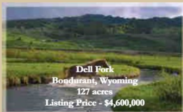
Dell Fork Bondurant, Wyoming 127 acres Listing Price - $4,600,000