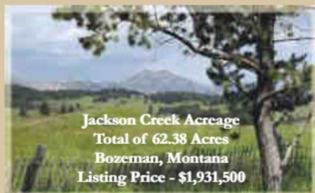
Jackson Creek Acreage Total of 62.38 Acres Bozeman, Montana Listing Price - $1,931,500