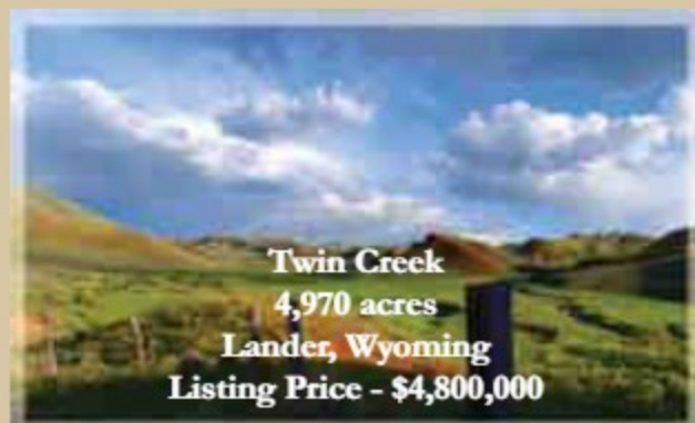
Twin Creek 4,970 acres Lander, Wyoming Listing Price - $4,800,000