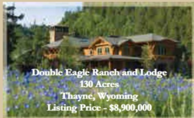
Double Eagle Ranch and Lodge 130 Acres Thayne, Wyoming Listing Price - $8,900,000