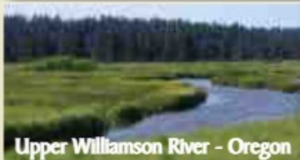
Upper Williamson River - Oregon