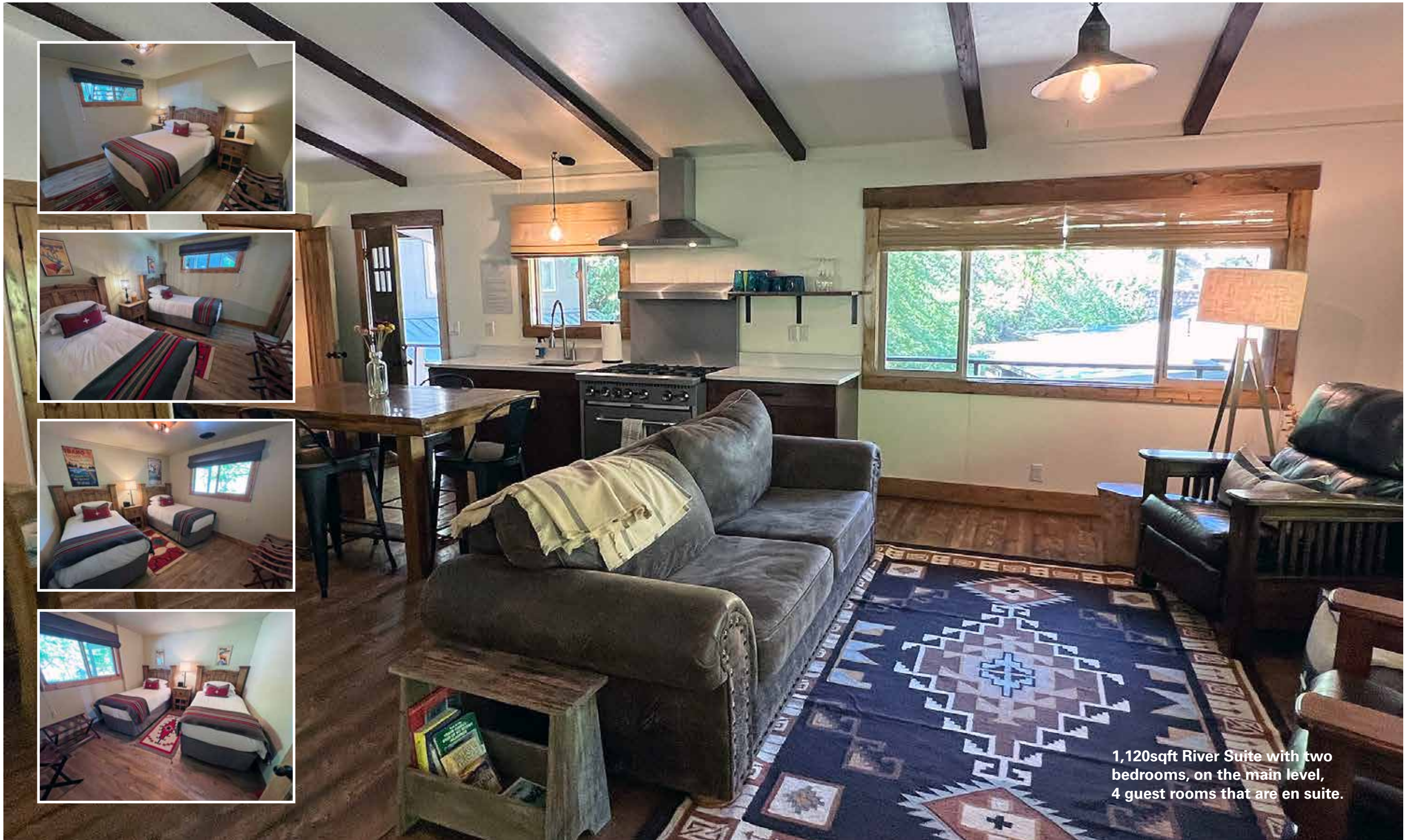
1,120sqft River Suite with two bedrooms, on the main level, 4 guest rooms that are en suite.