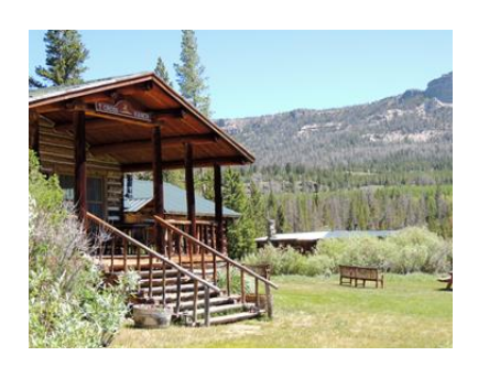
T Cross Ranch Dubois, WY Price: $3,500,000 Acreage: 160 Acres Features: