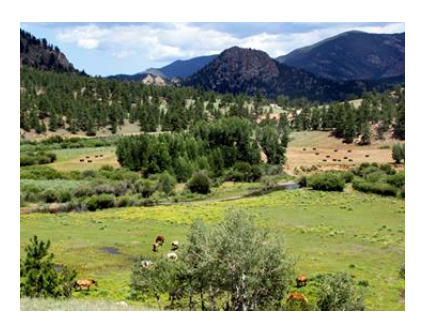
Tarryall River Ranch Lake George, CO Price: $2,400,000 Reduced! Acreage: 90 Acres Features: