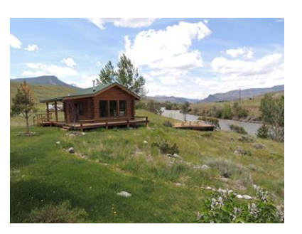
Rocking D River Ranch Wapiti, WY Price: $1,800,000 Acreage: 65 Acres Features: