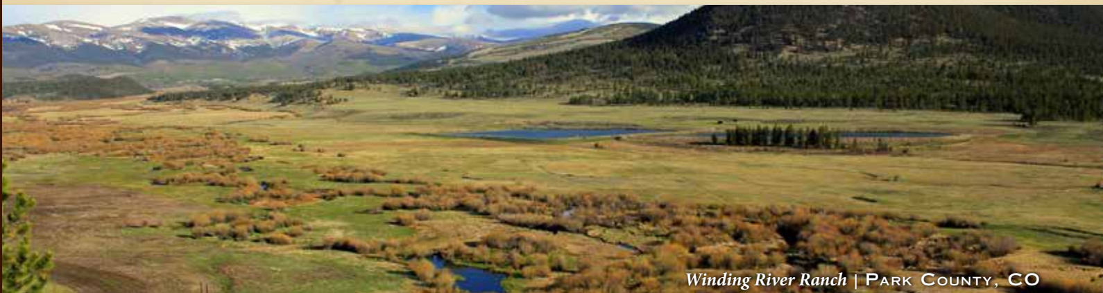
Winding River Ranch | PARK COUNTY, CO