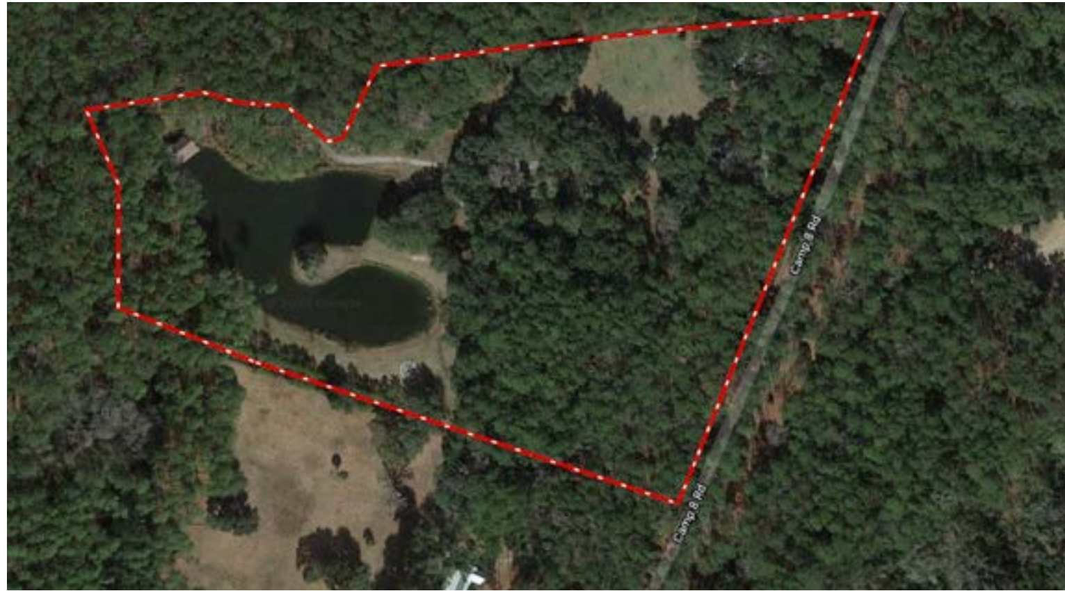
Retreat at Palmetto Bluff Map

••Maps are for visual aid only accuracy is not guaranteed.