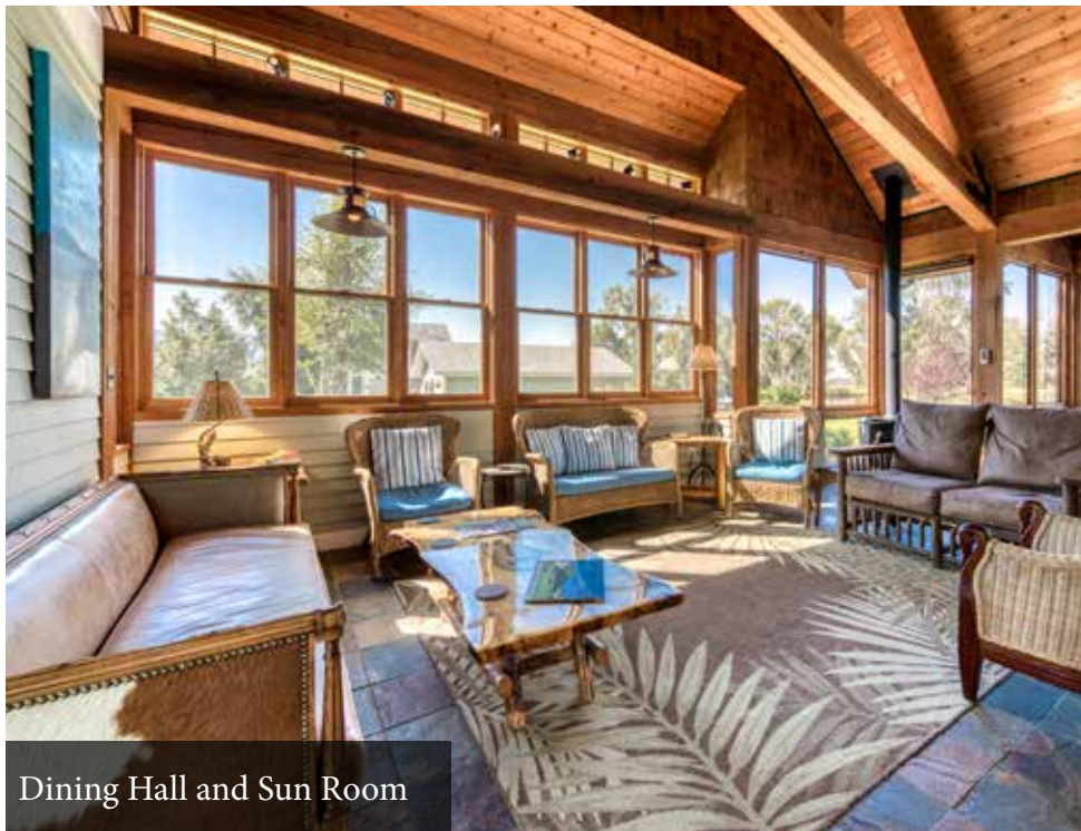
Dining Hall and Sun Room